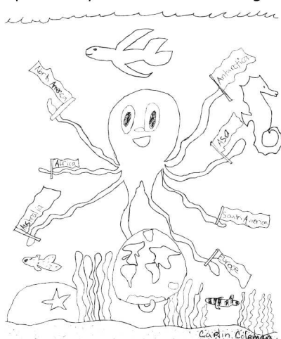
WESTLAKE CHARTER SCHOOL 2008-2009

I thought an octopus would be a good symbol for the school, because the number of tentacles are close to the number of continents in the world. My artwork represents an octopus reaching out to different places - just like our school. I felt really happy when I found out that I won the school t-shirt contest, and that everybody would be wearing a t-shirt that I designed. WOW!!! I encourage more students to enter the contest next year, because it is an honor to represent your school.